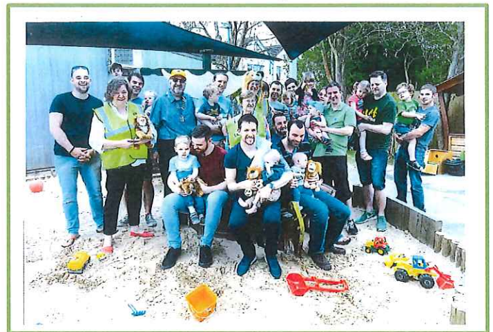
Alton Lions enjoying Saturday Dads

One group which continues to be popular on the first Saturday of each month is 'Saturday Dads' and thanks to the efforts of Alton Lions this has now been funded for a further year. As well as thanking the Alton Lions for their continued support the staff in the Children's Centre would like to thank those of you who spent time writing letters; speech bubbles and completing the Consultation questionnaire on-line. The outcome of the HCC Consultation shall be known on the 1 st July 2016